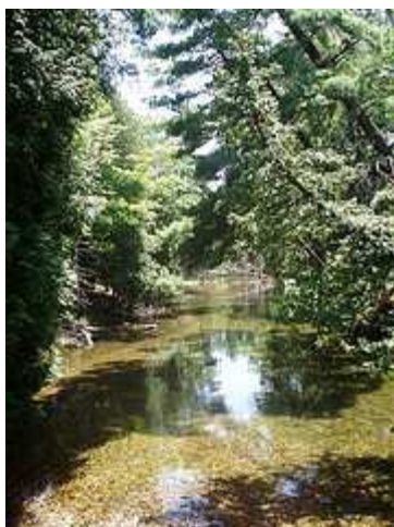
The Crystal River in her summer glory.

were ways to streamline the LAO's objectives with those of the school's, including fundraising, alumni functions and development issues. The LAO Board is working on refining our objectives to better benefit the alumni body and in turn, the school. We will be informing LAO members as any revisions are finalized.