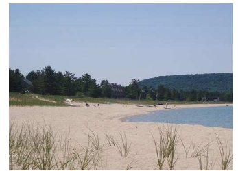
Life's a beach....

graduating class of Leelanau. Many of us came to Leelanau because for whatever reason, we didn't do well in our traditional learning environments. I look at my own story of a parent who had given up and saw con't pg. 2