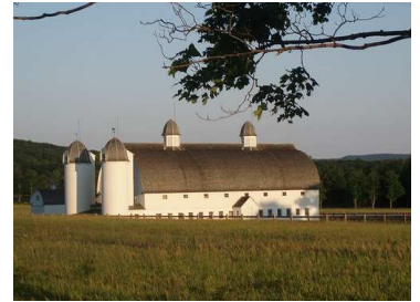
A summer afternoon fades on the DH Day Barn.