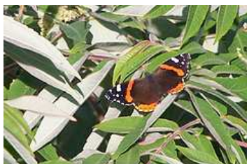
A butterfly rests on top of Miller Hill.

Membership dues will be due January 1, 2008 for all existing members (except lifetime members), and on the first of every year after .