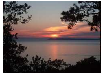
Breathtaking sunset over the Bay.

With every conversation, a knowing glance or an unspoken gesture, I see myself reflected in my classmates, and I continually marvel at all our tiny little class has achieved. We have successful restaurateurs, architects and designers, prolific writers and editors, leaders of businesses and non-profit organizations, medical professionals and entrepreneurs and I am filled with pride when I see where we've come from. And, I know this is the same story played out in every